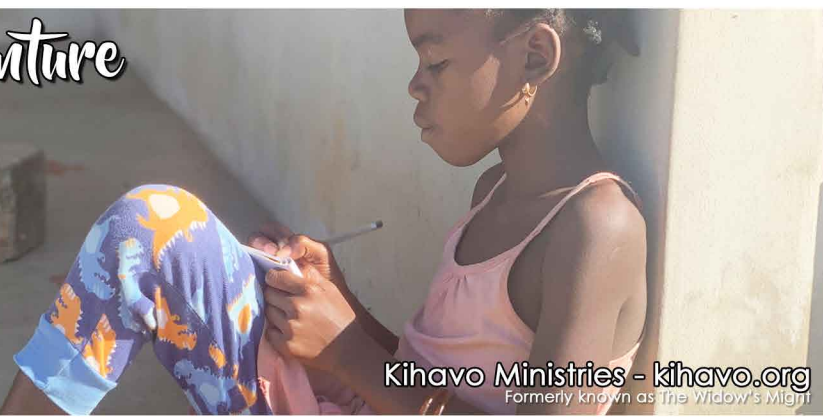
Kihavo Ministries - kihavo.org Formerly known as The Widow's Might